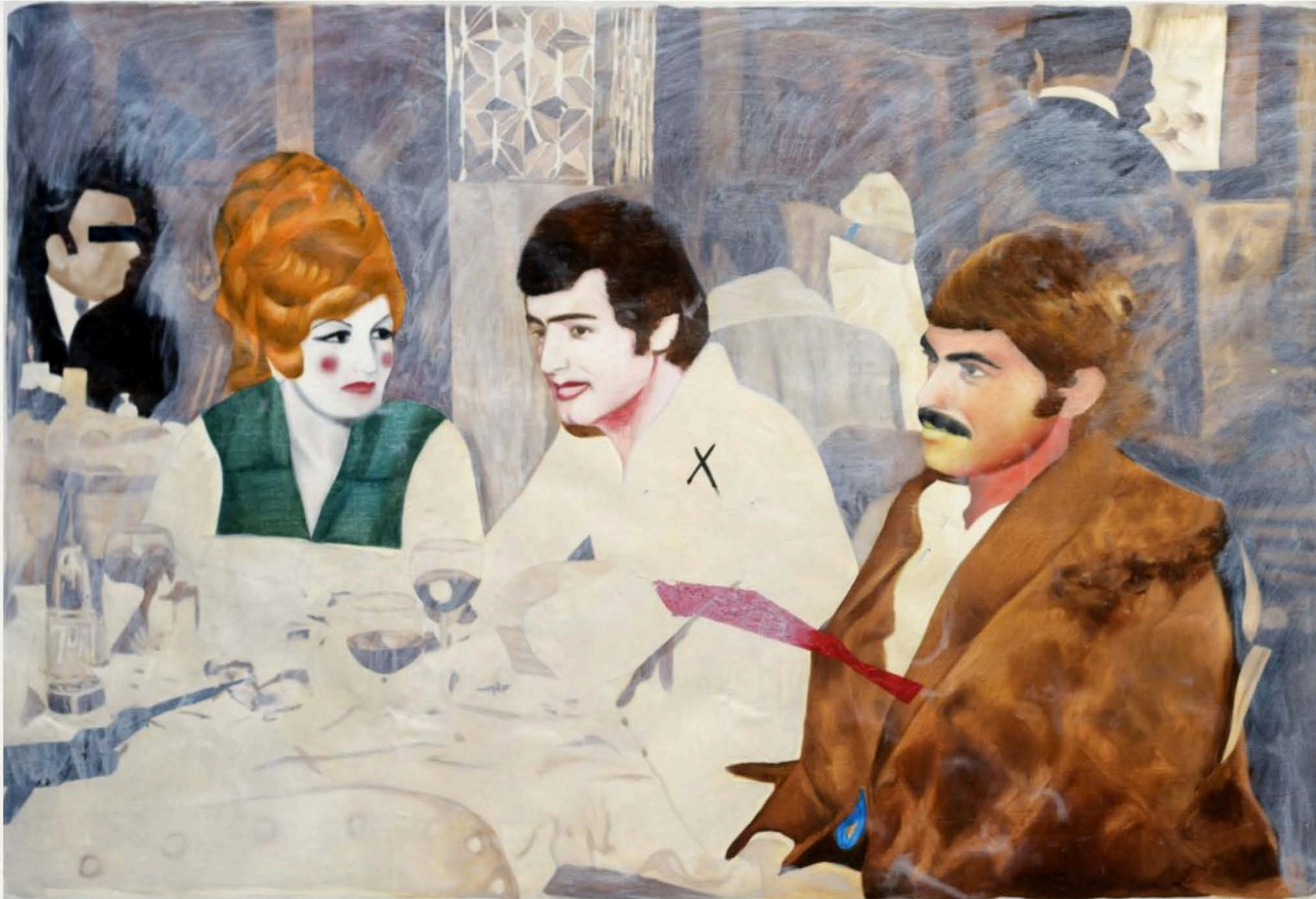
Ghasem Hajizadeh, Le Cabaret , 1979, oil on canvas, 130x162cm, Courtesy Amenor Contemporary, Stavanger, Norway x Simine Paris, Paris, France.