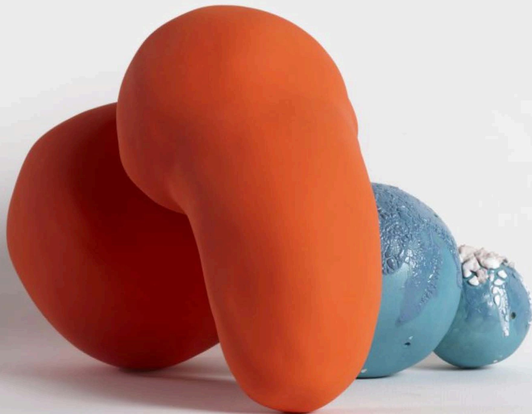
Nadine Roufael, Orange, 2022, Ceramic, base in velvet finish with special effect glaze, 50x26x20cm, Courtesy of Atelier Nadeen x jihad khairallah architects, Beirut