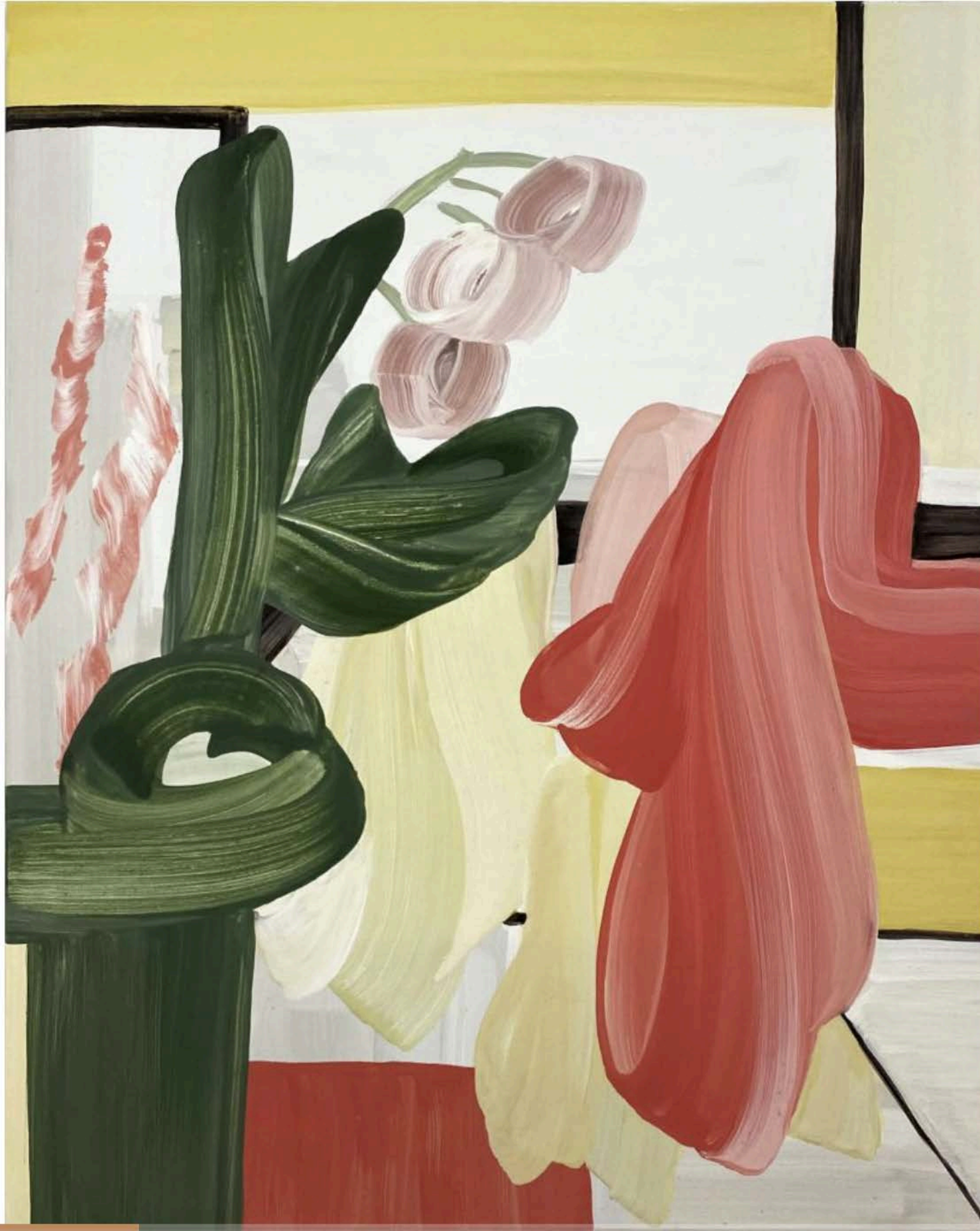
Mojé Assefjah, Song for a Tree , 2022, egg tempera on canvas, 100x80 cm, Courtesy Galerie Tanit, Beirut and Munich