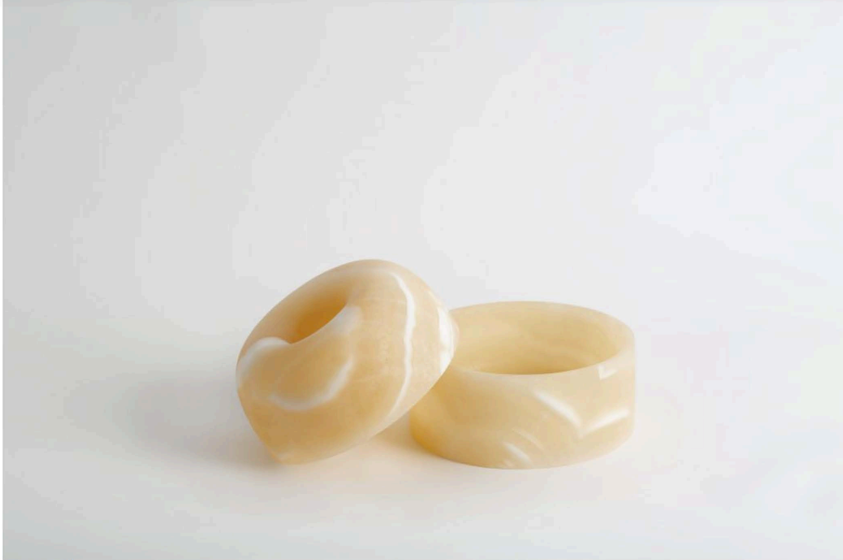
Omar Chakil, TORUS, Open box, raw massive hand carved Egyptian yellow Alabaster, 11x39x39 cm, Courtesy of Le LAB, Cairo, Egypt