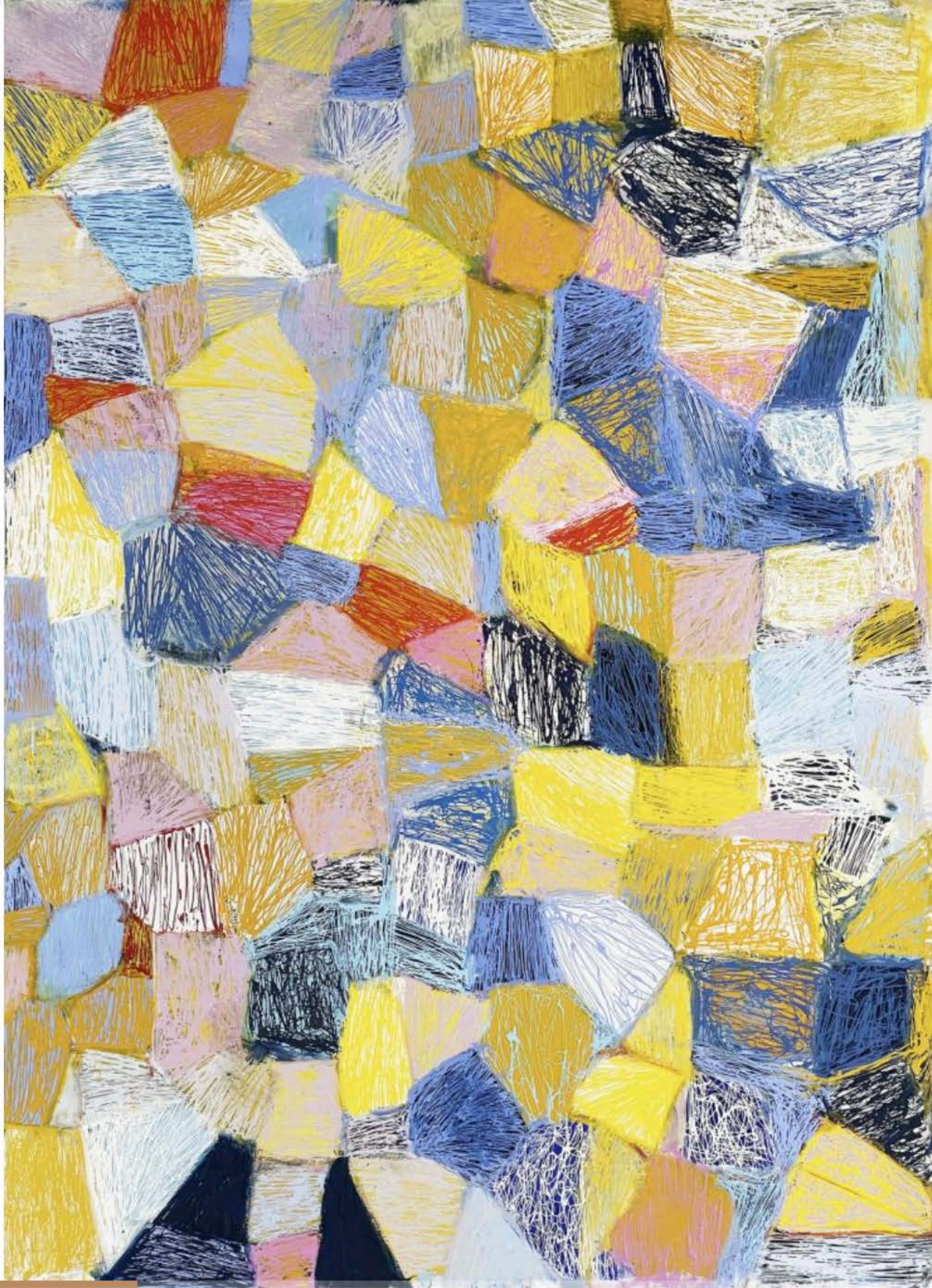
Reza Derakshani, Summer, De l'ensemble de 4 saisons + 2, 2022, oil, enamel and tar on canvas, diptych, 200x140 cm, Courtesy Amenor Contemporary, Stavanger, Norway x Simine Paris, Paris, France.