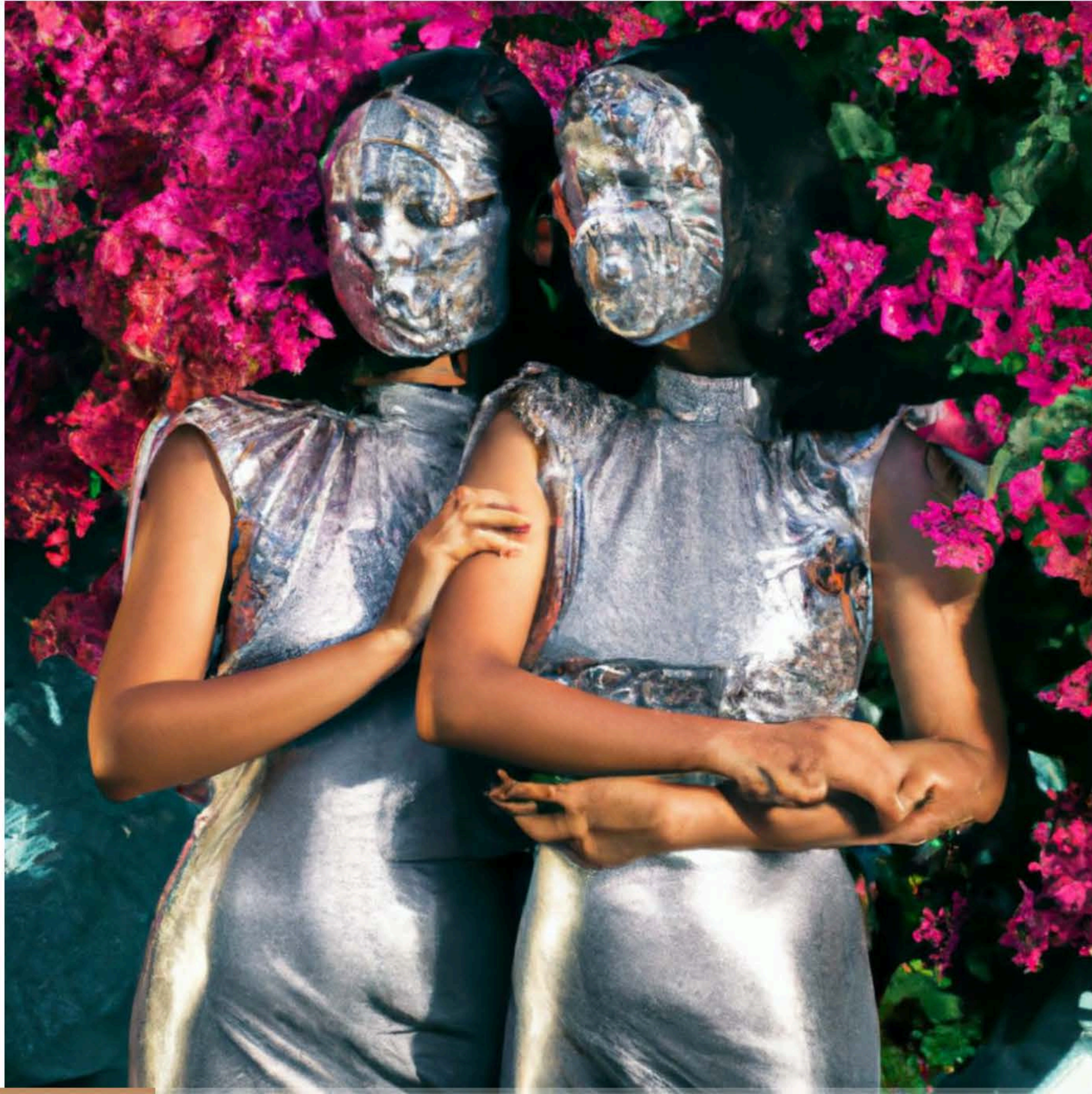
Eman Ali , Untitled #1, Banat Al Fi'9a (The Silver Girls), 2022, Fine Art Archival Pigment print on Hahnemühle Pearl, 20x20 cm, Edition of 5 + 2AP, Courtesy Hunna Art, Dubai